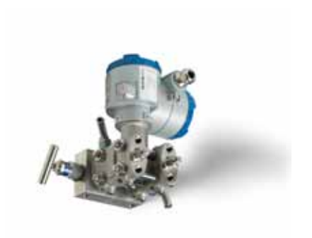
Electronic differential pressure transmitter