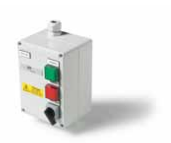
Motor starter box