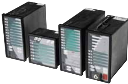
Alarm Units / BNWAS

Key words related to these Alarm Units are easy installation and programming, reliability, competitive pricing and class approval.